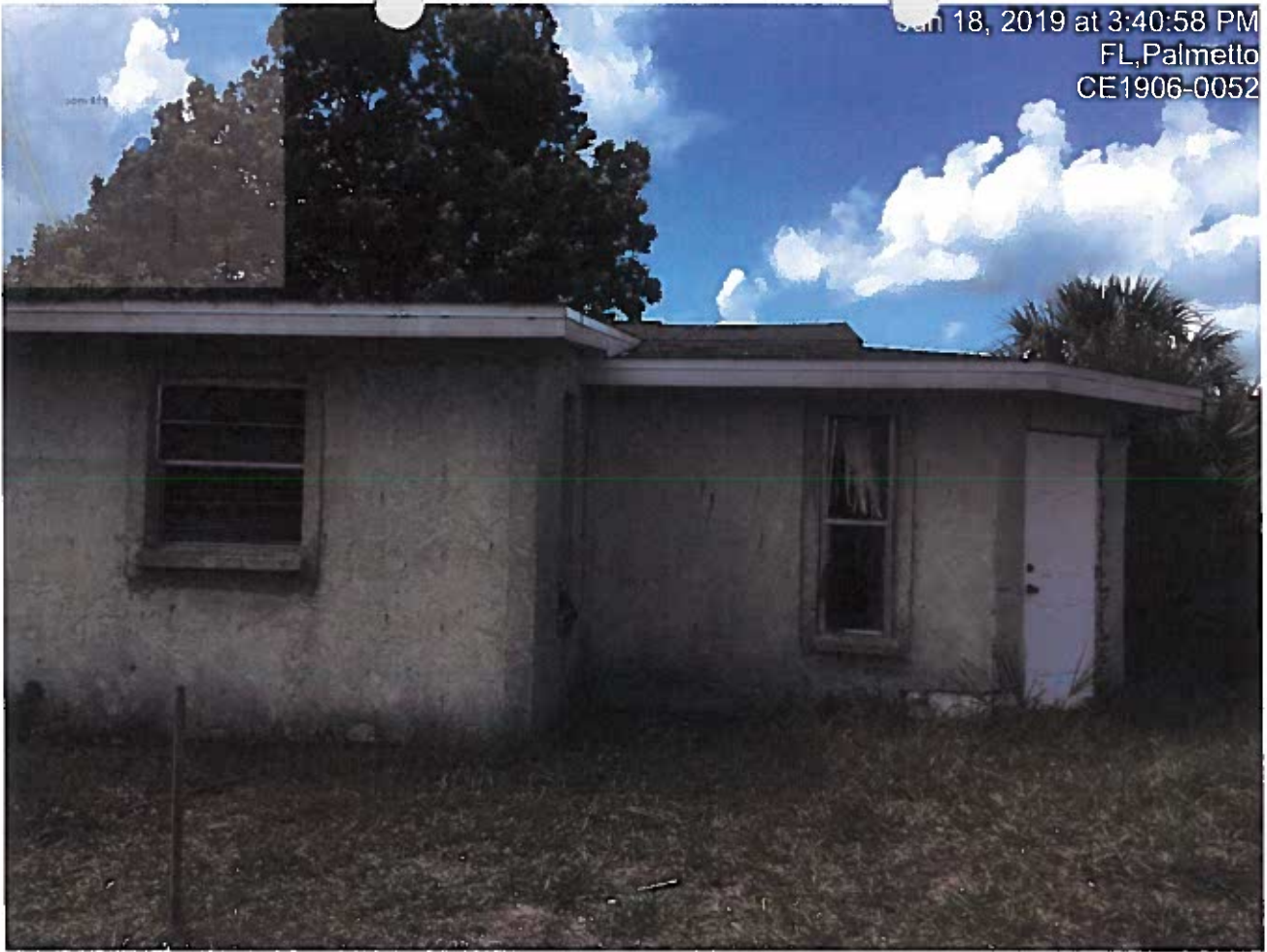
Jun 18, 2019 at 3:40:58 PM FL, Palmetto CE1906-0052