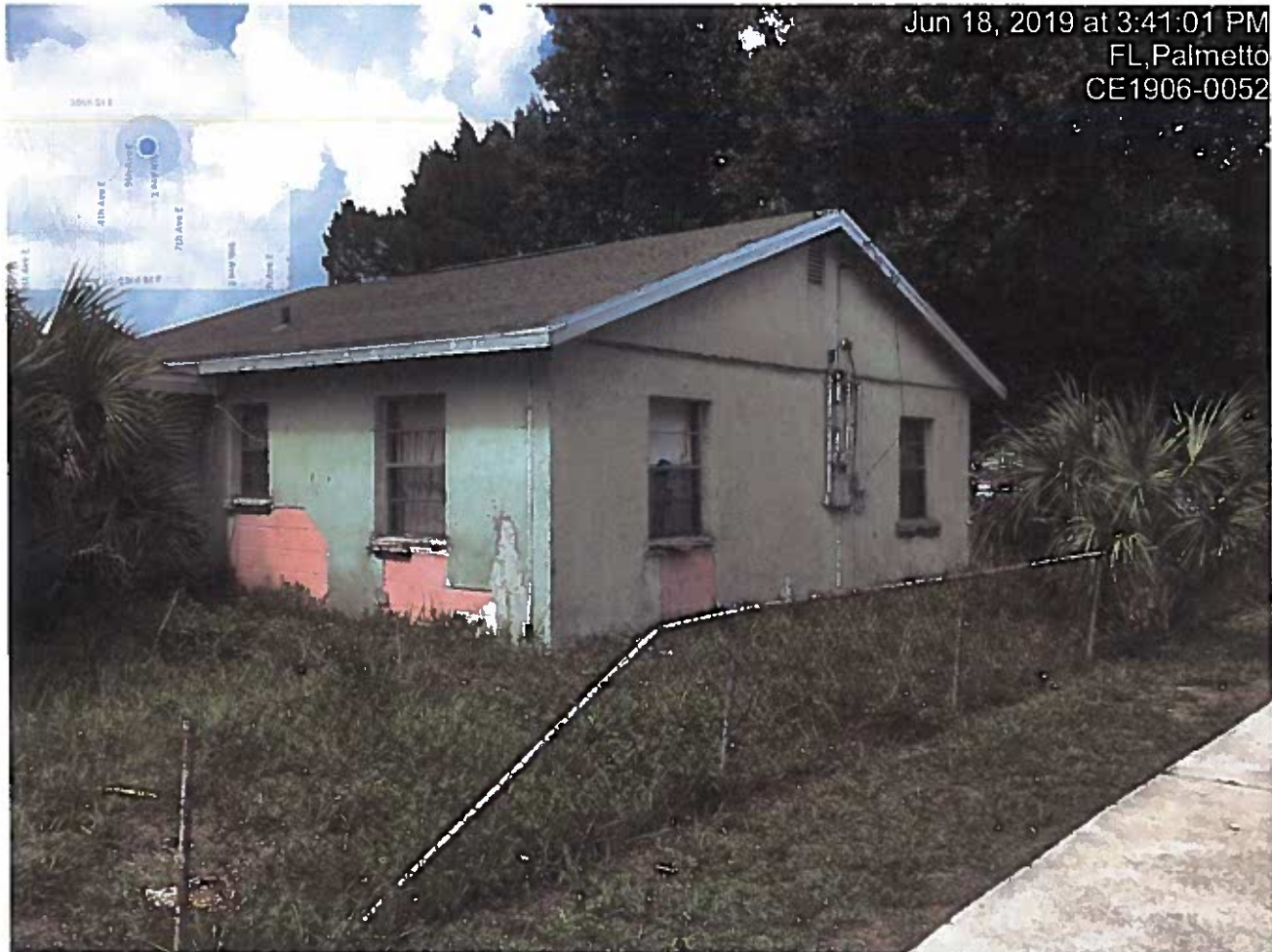
Jun 18, 2019 at 3:41:01 PM FL, Palmetto CE1906-0052