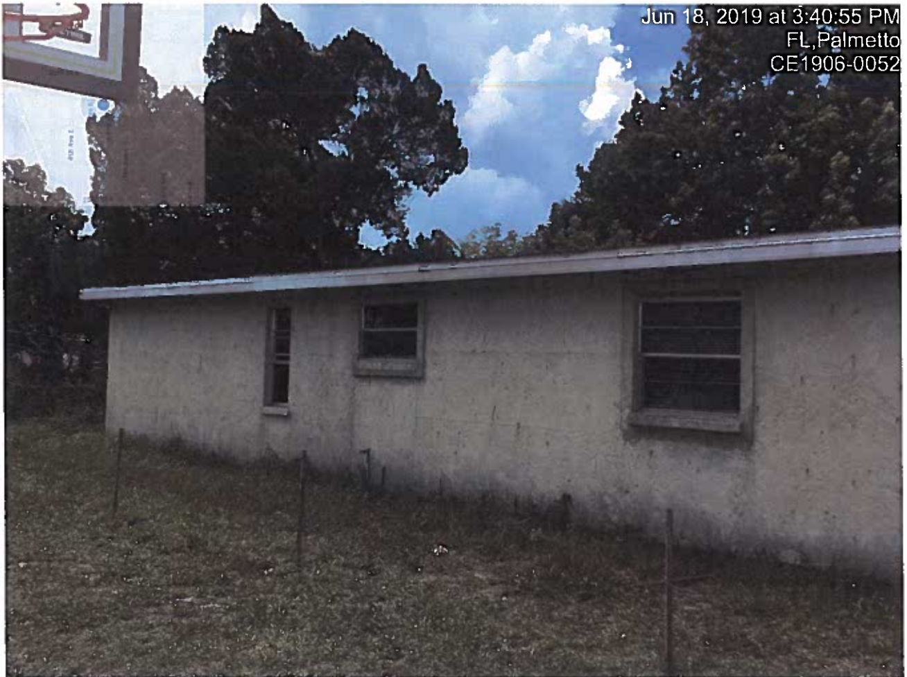
Jun 18, 2019 at 3:40:55 PM FL, Palmetto CE1906-0052