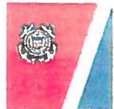
U.S. Coast Guard