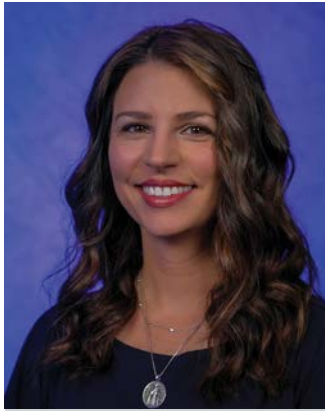
Commissioner Amanda Ballard District 2