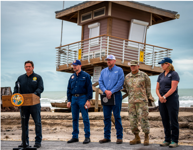
Governor Ron DeSantis speaks at a press conference held near the Pier after Hurricane Helene.

The City is also awaiting a potential $4 million reimbursement from FEMA. The pier is essential not only to Anna Maria’s identity but to the broader county’s tourism economy and quality of life. Its reconstruction is not optional, it’s imperative.