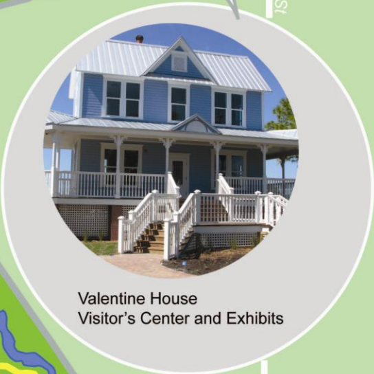
Valentine House Visitor's Center and Exhibits

Main Entrance 1704 99th Street West Bradenton, FL 34209