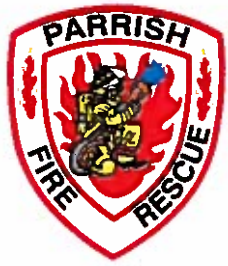
EXHIBIT A PARRISH FIRE DISTRICT